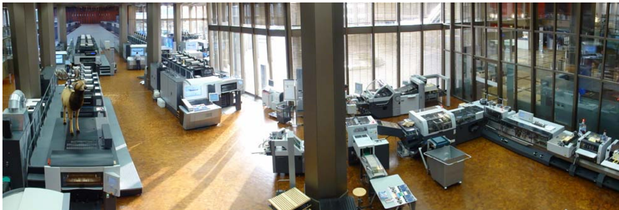
Heidelberg Press Hall: for demonstrations and training