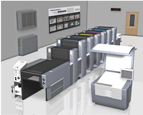
Heidelberg “pressroom” and control interface

Publication images like these are available from Sinapse: